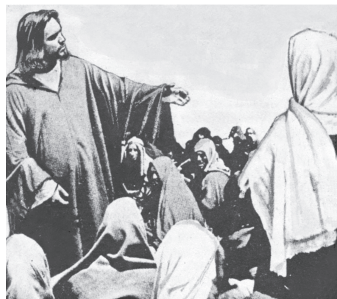
As they came near Jerusalem, at the towns of Bethphage and Bethany, they came to the Mount of Olives.

He stretched it out and it became well again. So the Pharisees left the synagogue and met at once with some members of Herod's party; and they made plans against Jesus to kill him.